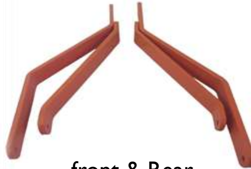
front & Rear Support