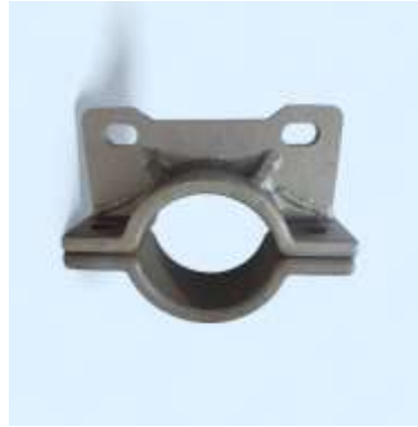
Hsg Forging Clamp