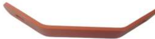
Vice Skid Semi+