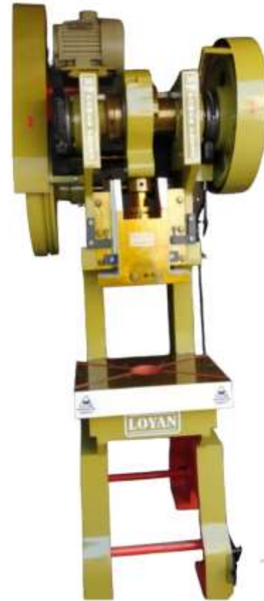
Loyan -30 Ton