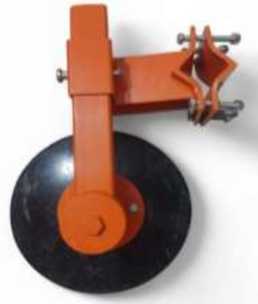
Side Disc Harrow Assly